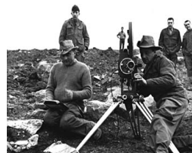
1959 - Tournage "Cinq Colonnes à la Une" pendant la Guerre d'Algérie André Hugues

Public Industrial and Commercial Enterprise